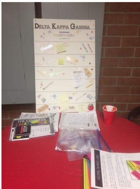
Our DKG Board at Taylor Hicks School explaining ways we can help their teachers!