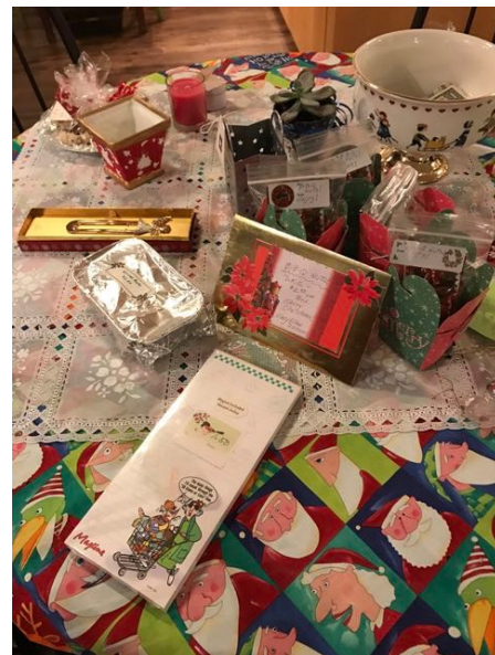
Boutique items were a hit at the December meeting: Fudge, cookies, spiced nuts, breads, Christmas decorations, household items, jewelry and more!