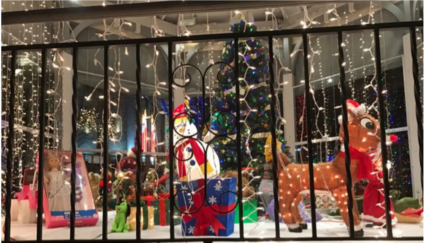
A Christmas Scene from the Gazebo on the Prescott Courthouse Square