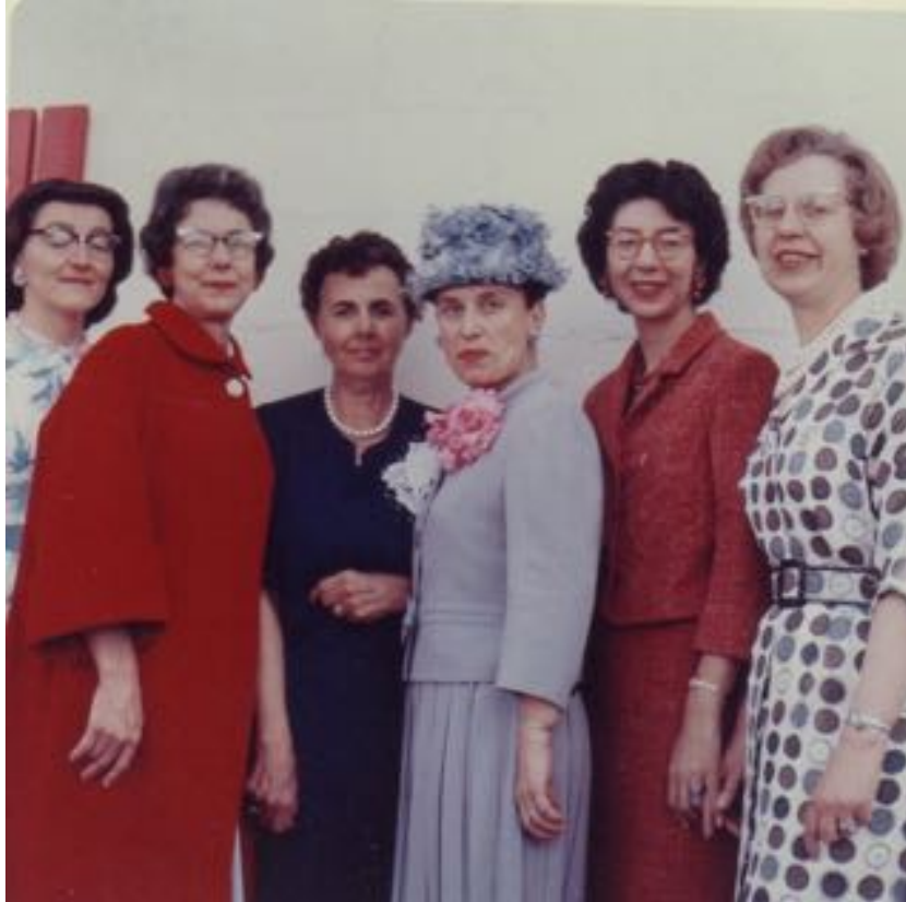
1962-1964 CHAPTER OFFICERS