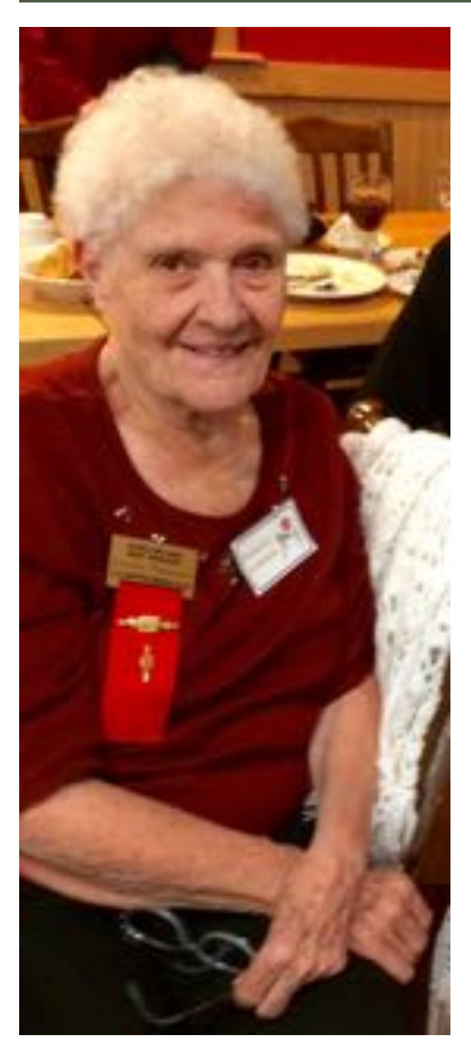
A good teacher can inspire hope, ignite the imagination, and instill a love of learning.