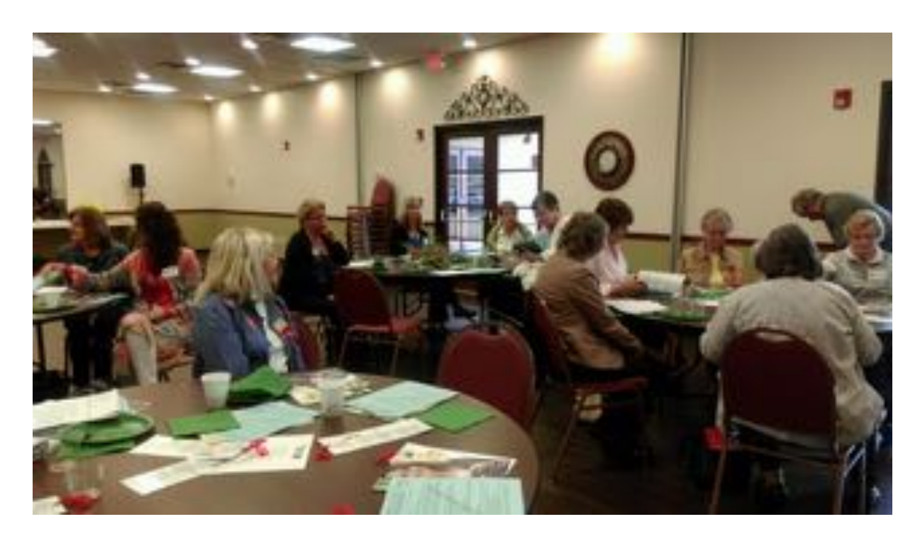
Members at the March 2016 meeting at the StoneRidge Community Center