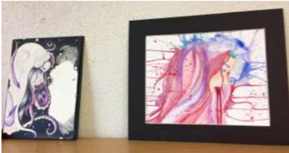
Student Art Work from the February Meeting!