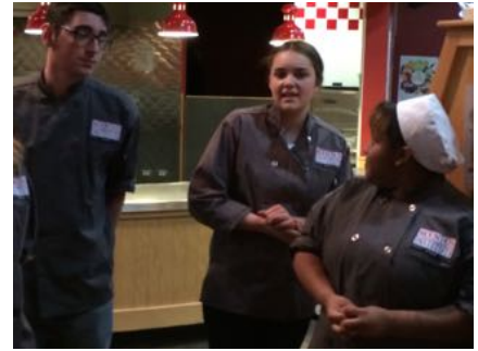
Photos of the Mountain Institute JTED students who prepared and served our delicious Christmas dinner!