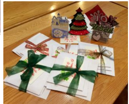
Some nicely made items for sale at the Christmas Boutique