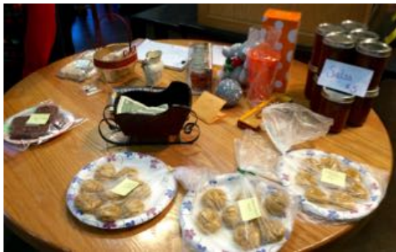
Lots of baked goods and other items for sale at the Christmas Boutique!