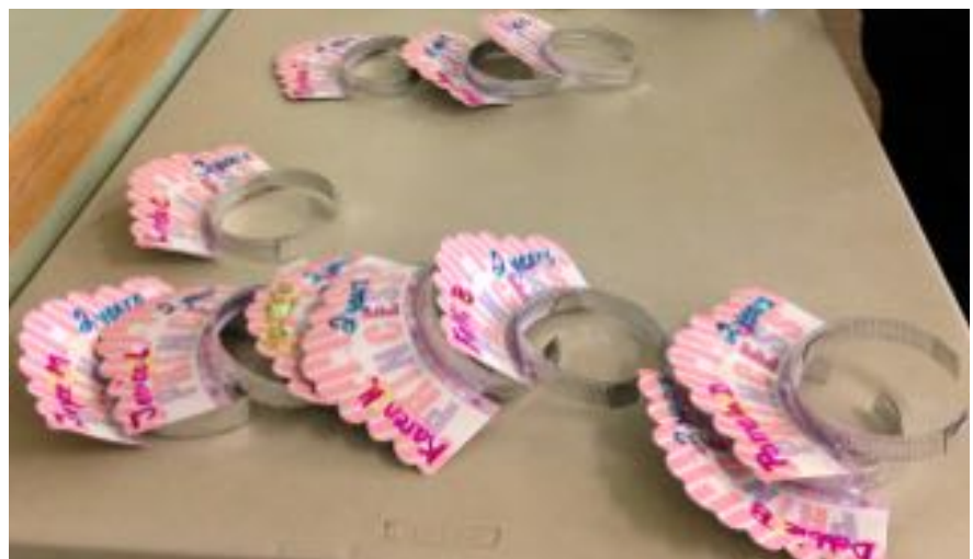
Princess Crowns were prepared for each member to wear at the August meeting depicting the number of years they had been in DKG.