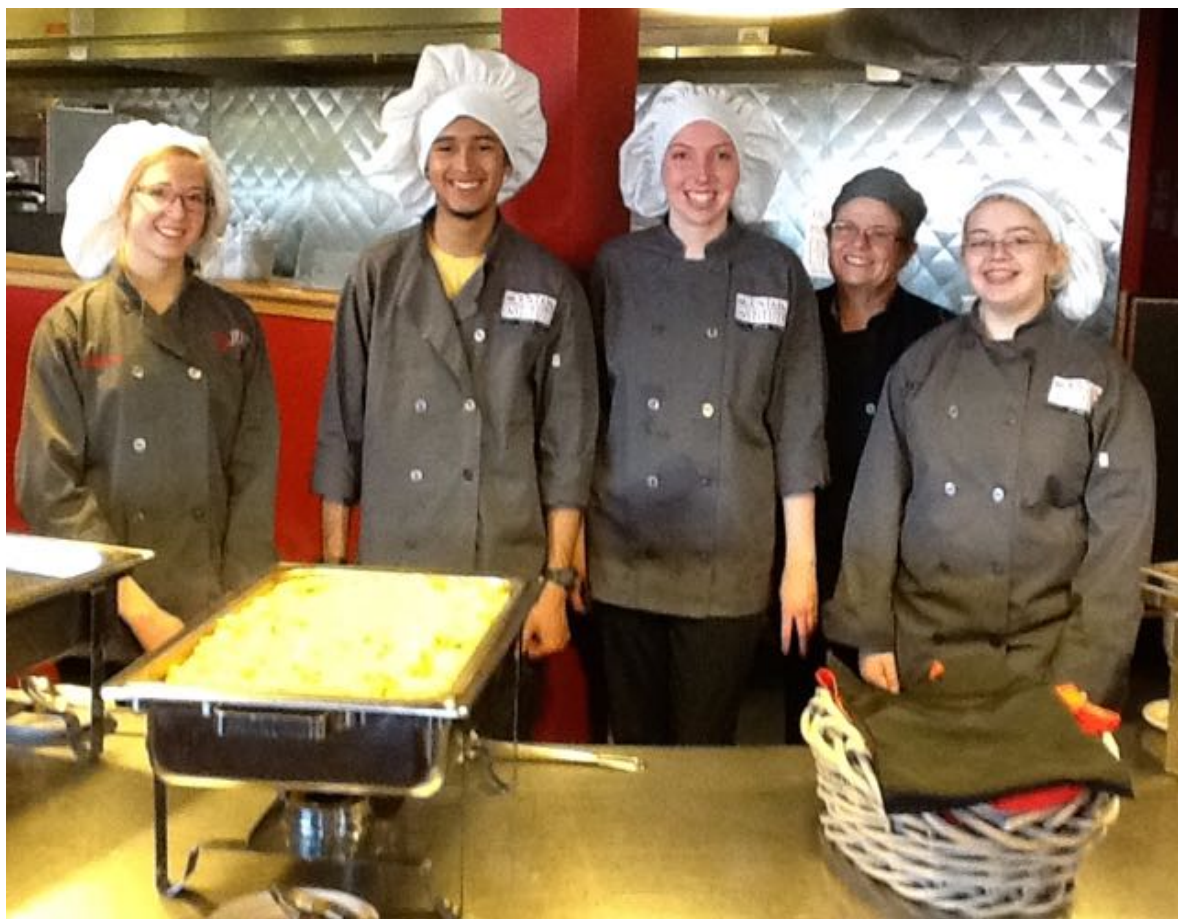
JTED Students provided the meal for the Honors Luncheon